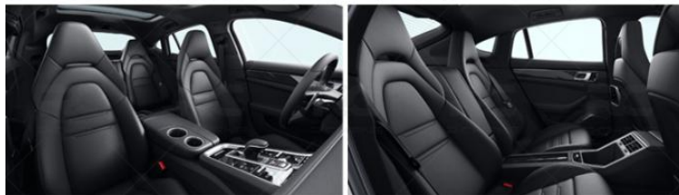
Sports car grade ergonomics Head-up display system Up-tilting center console Analog tachometer in the center of the instrument cluster Flat dashboard