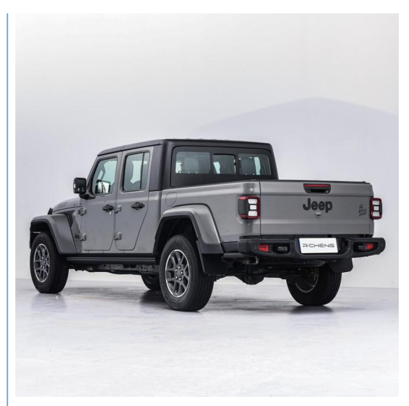
Check more Specifications of 2023 Jeep Gladiator 3.6L Overland Pickup Torque 347N.M Jiaodoushi Car For Sale MOQ 1 Unit Wholesale