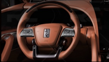
Four-panel steering wheel