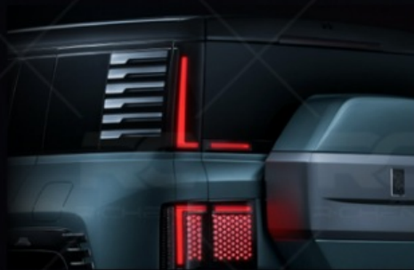
Multiple LED light belts in D column