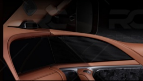
High-End sound system