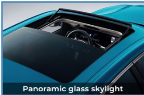
Panoramic glass skylight