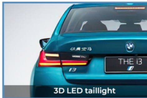
3D LED taillight