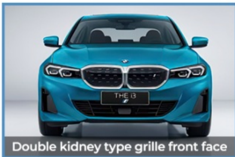
Double kidney type grille front face

Interpret the spirit of driving interest