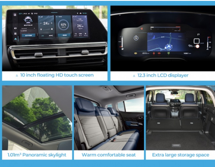
10 inch floating HD touch screen 12.3 inch LCD display 1.01m 3 Panoramic skylight Warm comfortable seat Extra large storage space