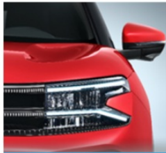
LED sharp headlights