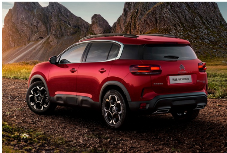
Performance beyond Front: McPherson independent suspension Rear: Torsion beam suspension suspension EPS electronic power steering system

Front: McPherson independent suspension/Rear: Torsion beam suspension suspension EPS electronic power steering system