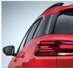
LED edge taillights