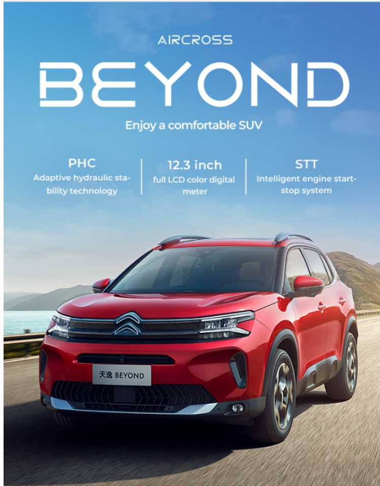
AIRCROSSBEYOND Enjoy a comfortable SUV PHC Adaptive hydraulic stability technology 12.3 inch full LCD color digital meter STT Intelligent engine start-stop system