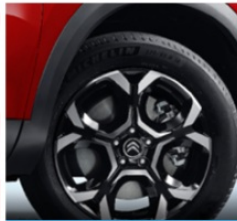
18 inch wheel

Design beyond The starry sky is twinkling on the face 2730mm extra long wheelbase Highlight the black roofrack Aerodynamic air intakes for type 2 chain LED sharp headlights LED edge taillights 18 inch wheel