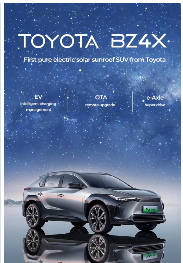
TOYOTA BZ4X First pure electric solar sunroof SUV from Toyota Intelligent charging management remote upgrade e-Axle super drive