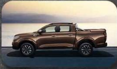
Luxury car body