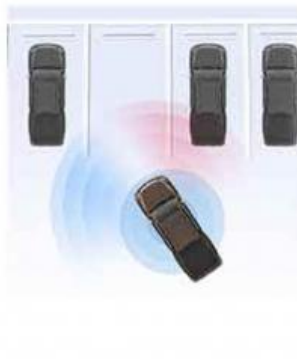
Fully automatic parking system