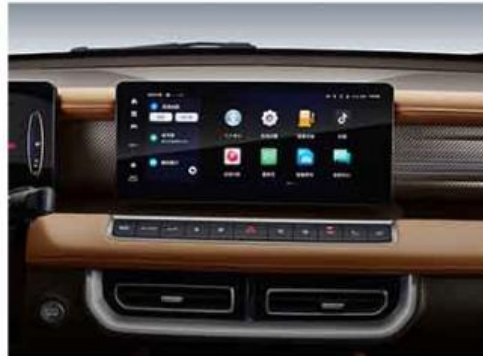
a new generation of car networking