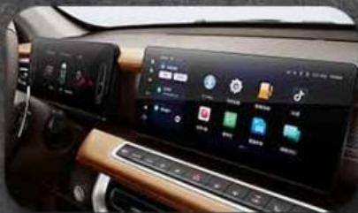
7 inch LCD instrument panel + 12.3 inch smart central control