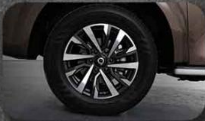
18 "aluminum alloy wheels