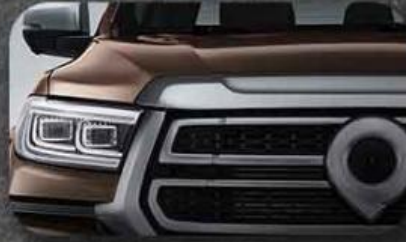
Sharp Hawk-eye LED headlights