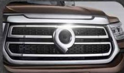
Matrix intake grille