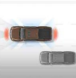
L2+ level intelligent driving control