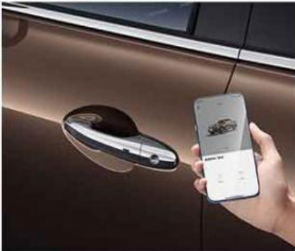
Mobile phone Bluetooth key