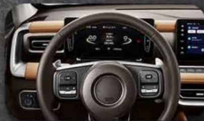
Leather steering wheel