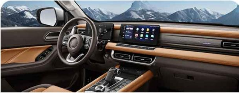
Reevolution of higher intelligence