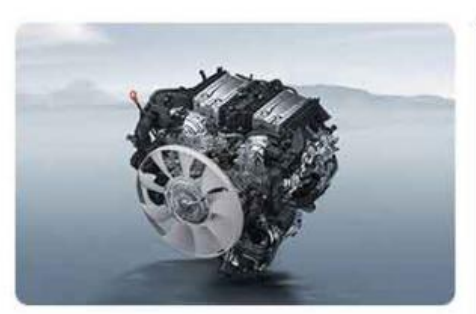
3.0T V6 dual supercharged gasoline engine