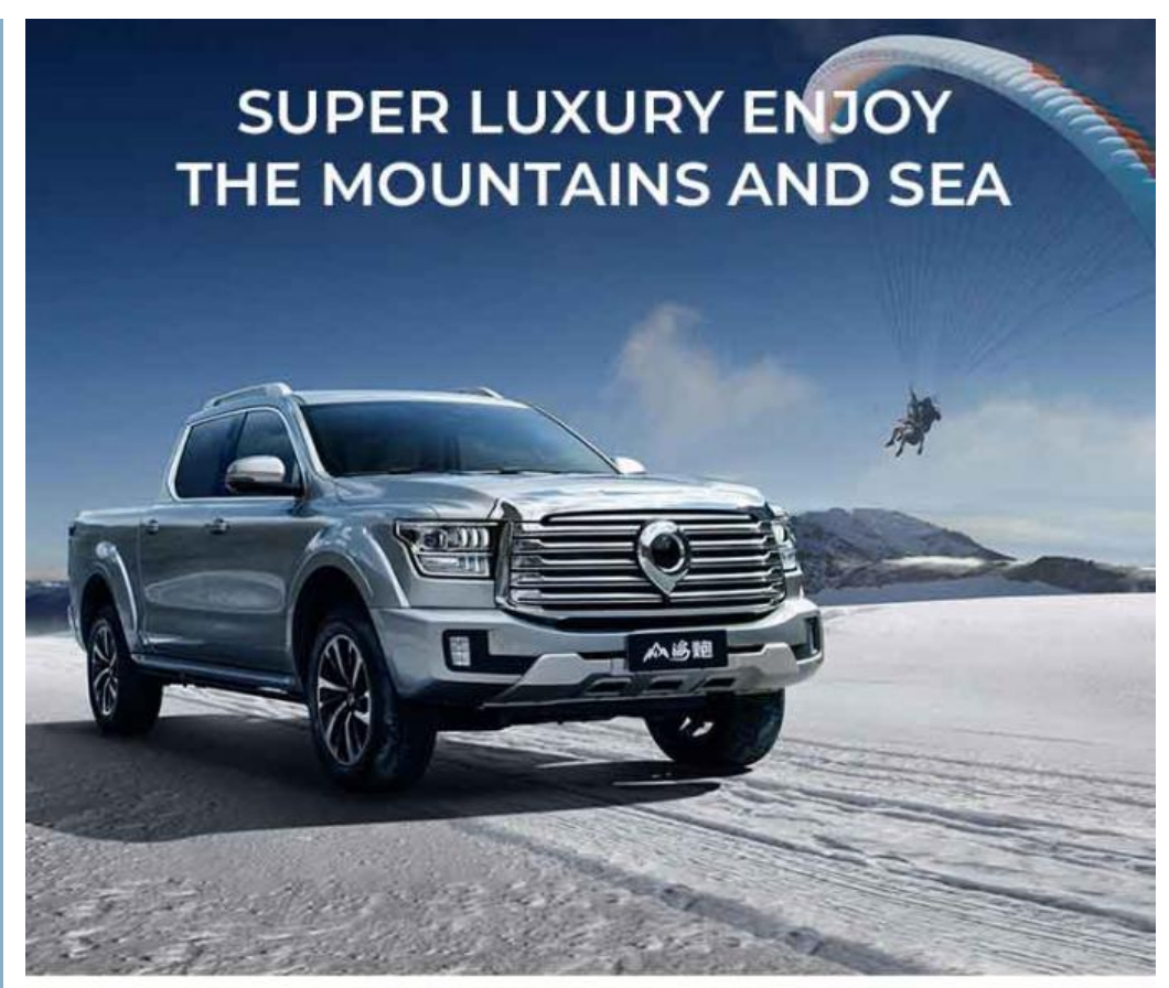
Powerful and stylish, like a peak