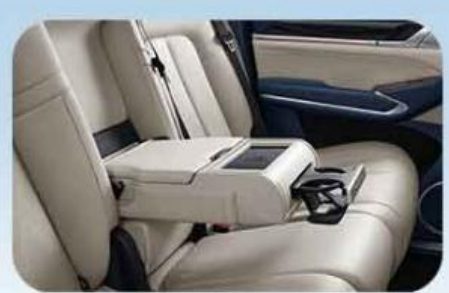
Extreme comfort ride experience