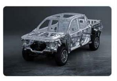
Ultra-high strength body