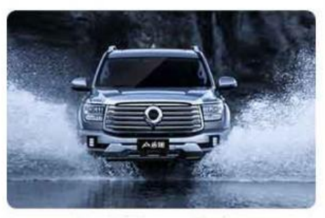
Control the sea freely