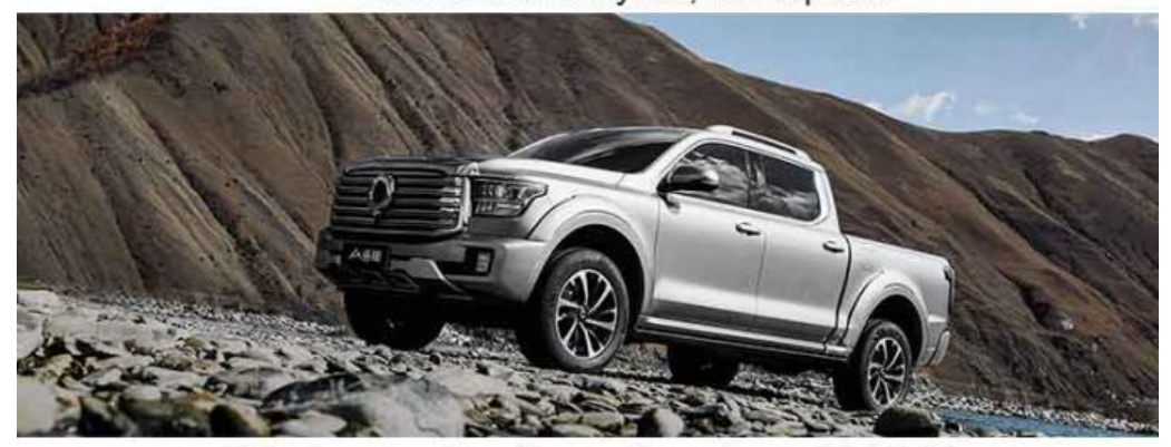
LED dazzling headlamp, the edge of highlights