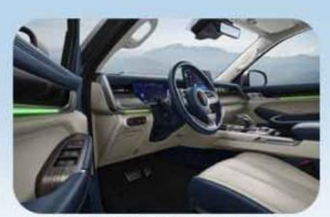
Premium luxury quality cabin

14.6 "full touch screen, 12.3" digital instrument, high-quality brand audio, using technology to link people, cars, life, sit and enjoy the audio-visual feast, wonderful at your fingertips