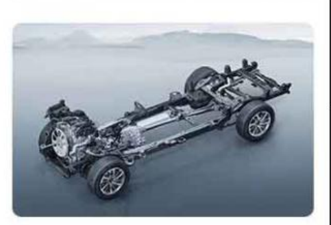
Suspension upgrade precision adjustment