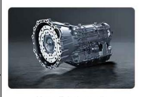
More efficient, smoother 9AT transmission