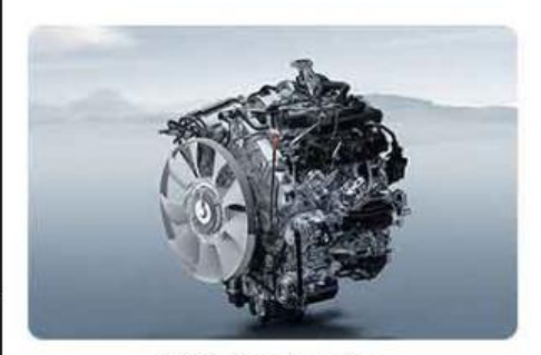
2.4T diesel engine