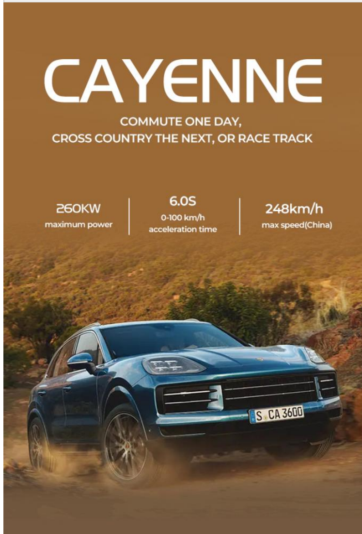
CAYENNE COMMUTE ONE DAY,CROSS COUNTRY THE NEXT, OR RACE TRACK maximum power 260KW 0-100 km/h/acceleration time 6.0s max speed(China) 248km/h