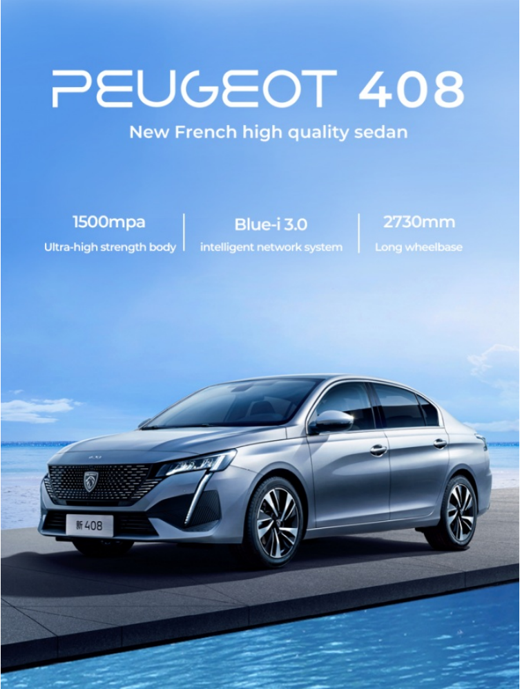
PEUGEOT 408 New French high quality sedan 1500mpa Blue-i 3.0 Ultra-high strength body intelligent network system 2730mm Long wheelbase

Dongfeng Peugeot 408 French Quality Sedan produced in China