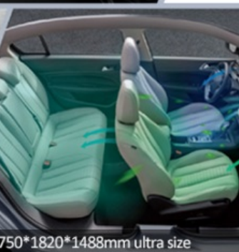
4750*1820*1488mm ultra size