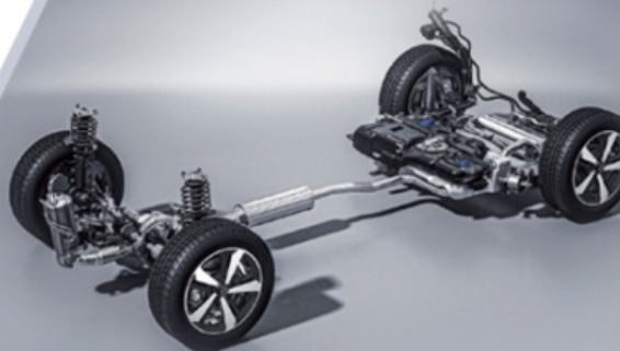
A hundred years of master CLDR tuning chassis

Driving mode selection (Standard, Sport, Snow)