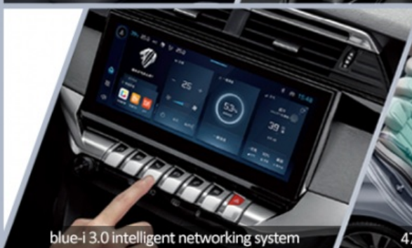
blue-i 3.0 intelligent networking system