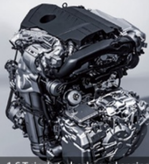
1.6 T single turbocharged engine Aisin 6AT third generation hand automatic transmission

▲ Leather small multi-function racing wheel