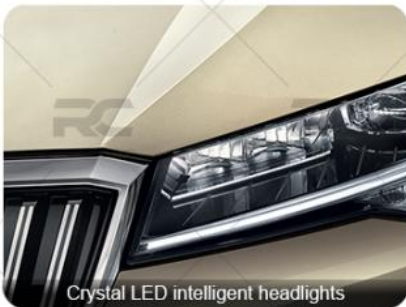
Crystal LED intelligent headlights