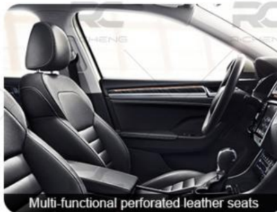
Multi-functional perforated leather seats

Crystal LED intelligent headlights Stereo Crystal LED taillights Chrome-plated tail trim design Stereo crystal LED taillights Multi-functional perforated leather seats