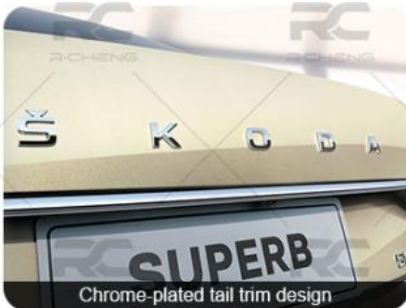
Chrome-plated tail trim design