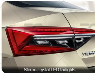
Stereo crystal LED taillights