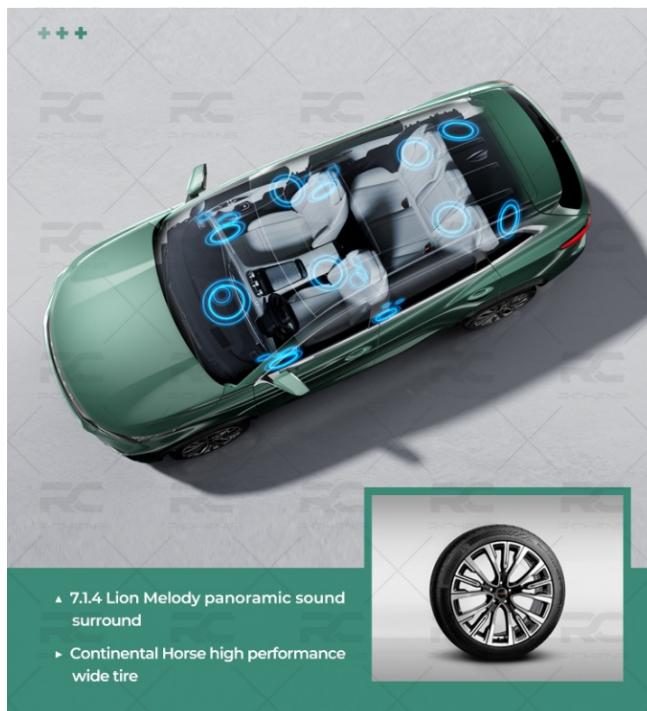
7.1.4 Lion Melody panoramic soundsurround Continental Horse high performance wide tire