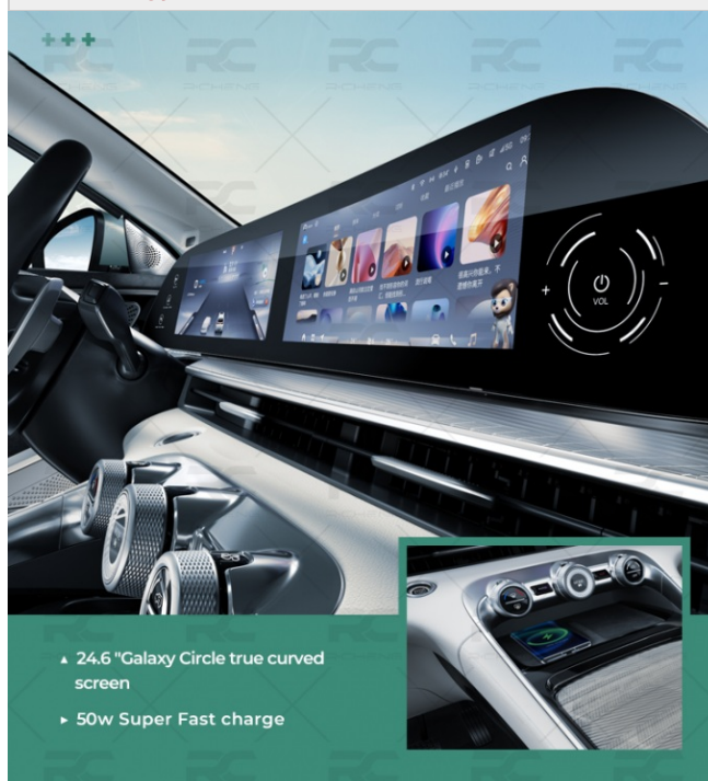
24.6" Galaxy Circle true curved screen 50w Super Fast charge