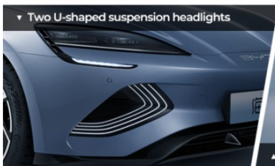
▼ Two U-shaped suspension headlights