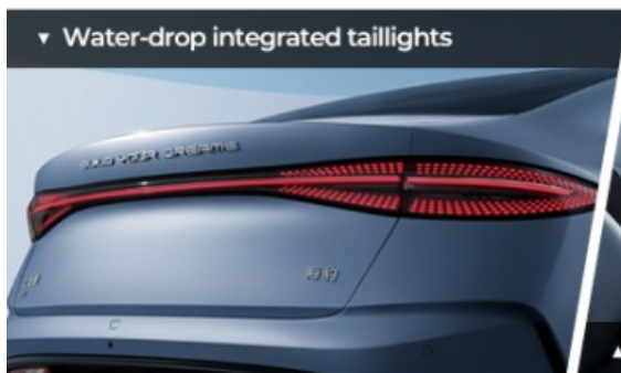
▼ Water-drop integrated taillights