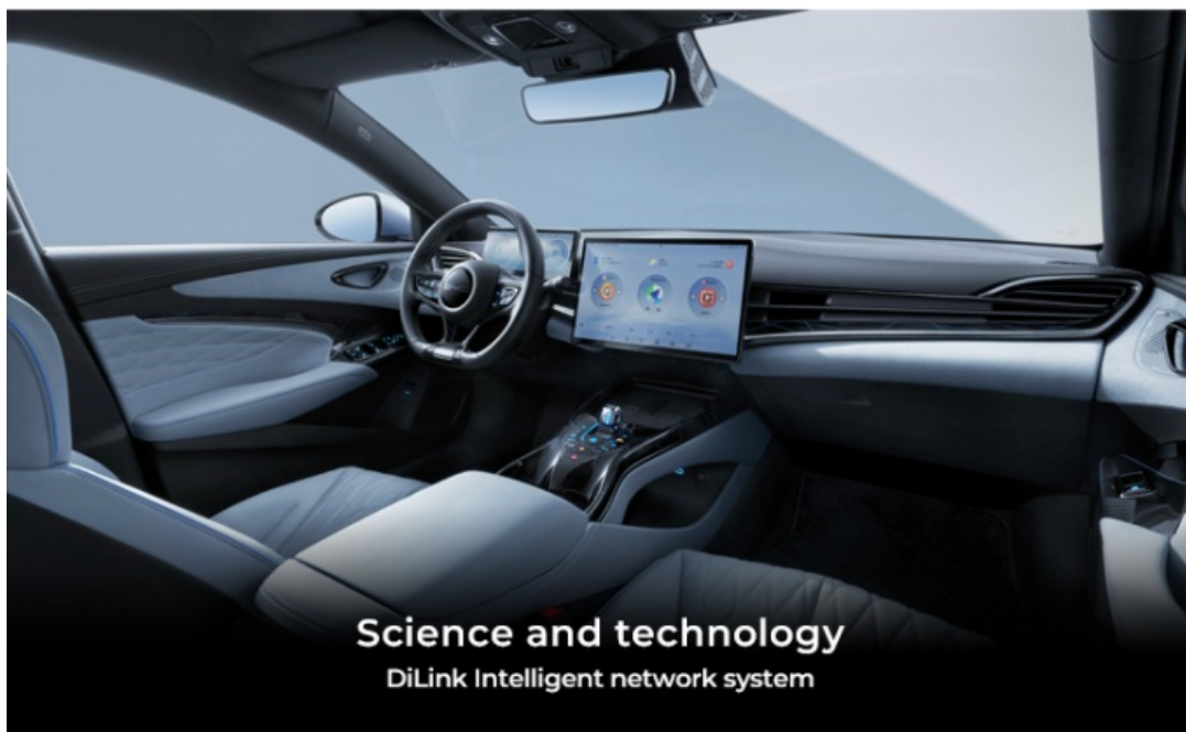
Science and technology DiLink Intelligent network system