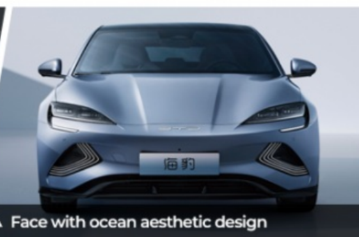
▲ Face with ocean aesthetic design