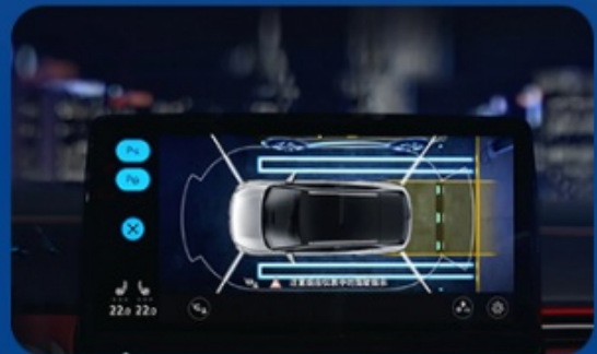
IQ. 360 Panorama