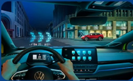
IQ. Intelligent vision