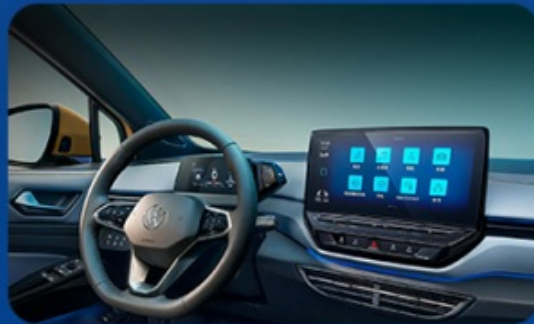
IQ. Smart Car networking