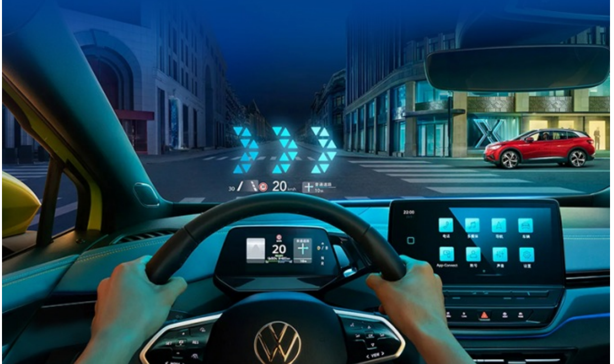
IQ. Valet butler