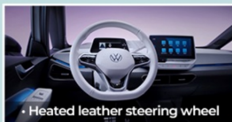
• Heated leather steering wheel