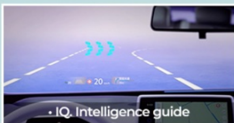
• IQ. Intelligence guide