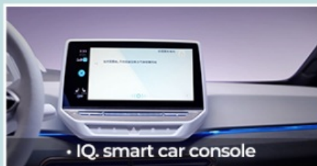
• IQ. smart car console