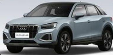
● LIGHT GRAY