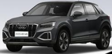
● DARK GRAY