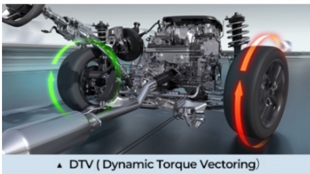
▲ DTV ( Dynamic Torque Vectoring)