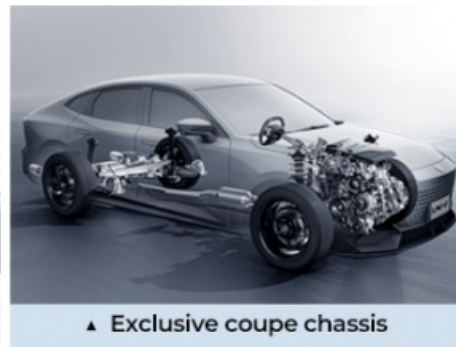
▲ Exclusive coupe chassis