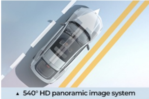
▲ 540° HD panoramic image system