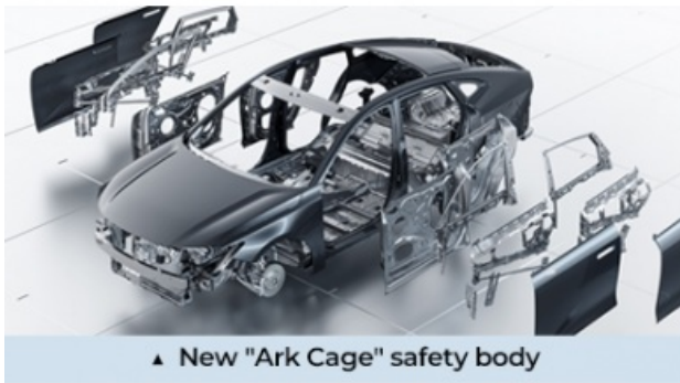
▲ New "Ark Cage" safety body