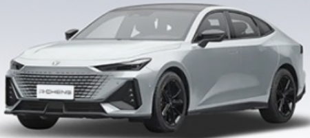
● LIGHT GREY