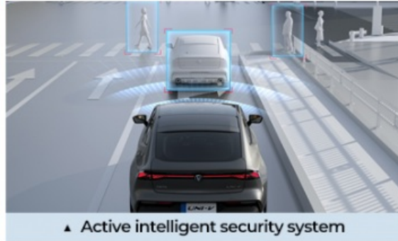
▲ Active intelligent security system