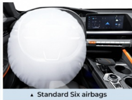
▲ Standard Six airbags