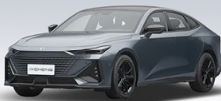
● DARK GREY