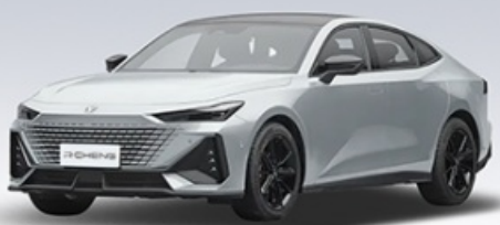
● LIGHT GREY