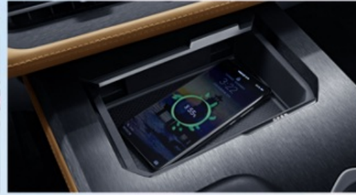
▲ 15W mobile phone wireless charging