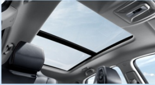
▲ 67-inch panoramic skylight