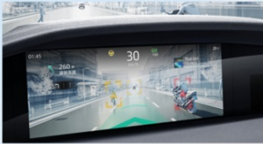
▲ AR navigation