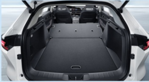
▲ Flexible luggage space