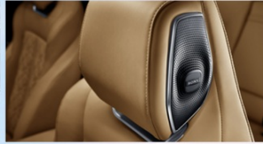
▲ SONY headrest stereo speaker