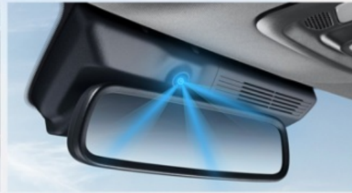
▲ IMS intelligent cockpit interaction system