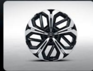
• 19" aluminum wheel

Combined with precise line cutting and flowing shapes Add tension to the look