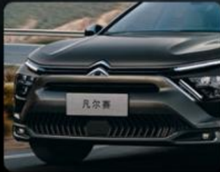
• Active intake grille