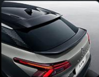
• Suspension twin tail