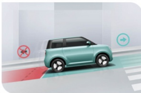
NBooster intelligent braking system ▼