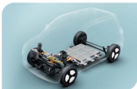
▲ Comprehensive battery protection