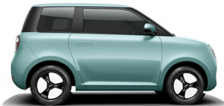
Comfortable And Large Space