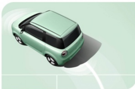
Reversing radars and reversing image ▼