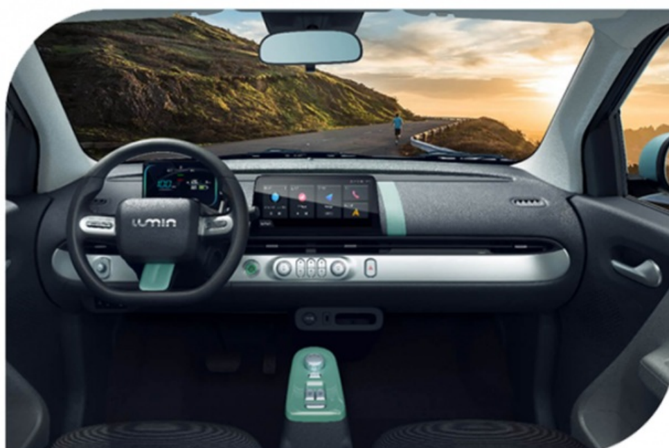
Broader view, better driving experience