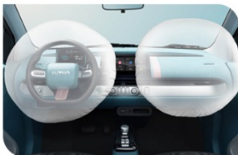
▲ Two airbags at the front row