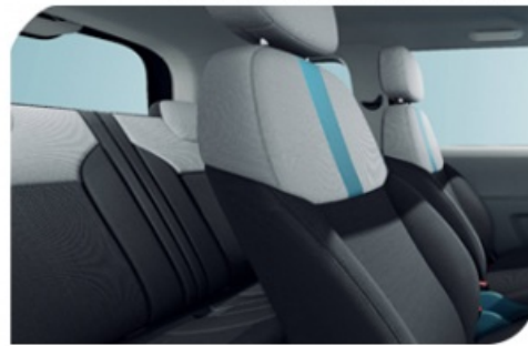
Elegant and exquisite cabin ▼