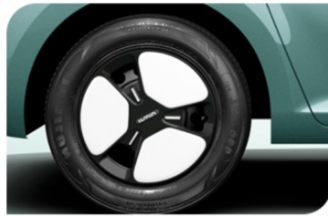
14-inch dynamic wheel ▼