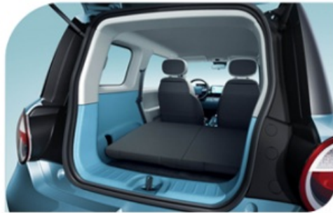
▲ 104L spacious trunk