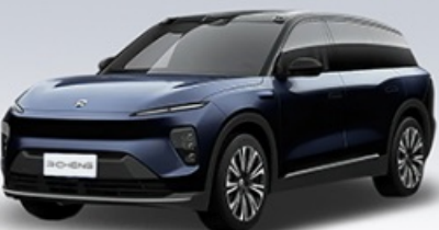
● DARK BLUE

RUICHENG Chengdu Ruicheng Automobile Service Co., Ltd.