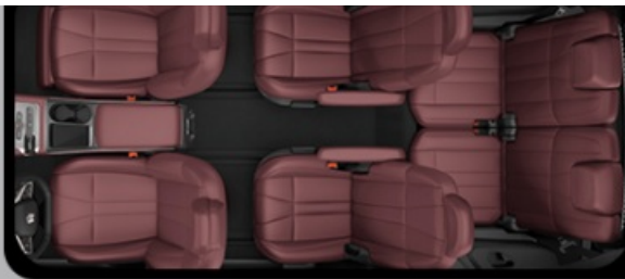
Six large Spaces