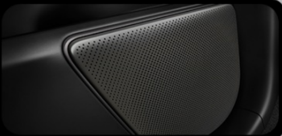
Meteorite chrome - plated speaker cover