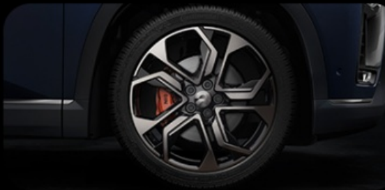
21 "sport alloy rims and air orange calipers