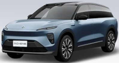
● LIGHT BLUE