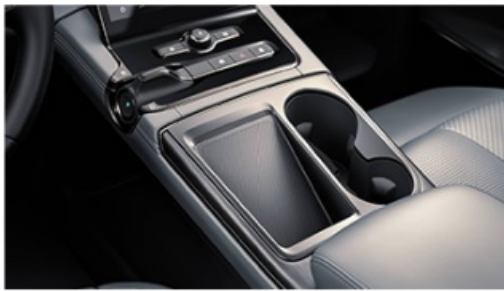
Just the right storage space