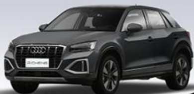
● DARK GRAY