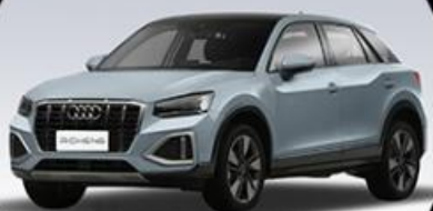
● LIGHT GRAY