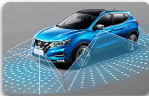
AVM panoramic intelligent monitoring