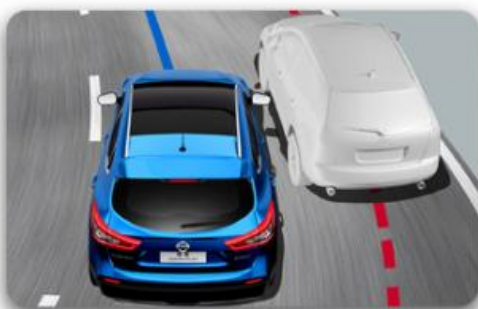
iEB Intelligent Engine Braking