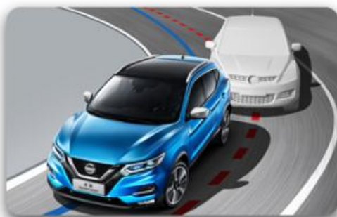
ITC intelligent tracking control