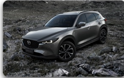
Off-road traction assistance system