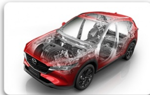
High strength steel plate up to 1800mpa