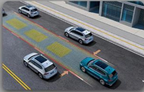
Intelligent driving assistance system