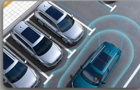
Intelligent parking assistance system Collision assistance system