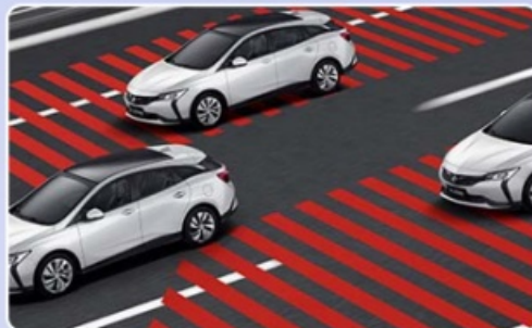
▲ SBZA side blind spot warning