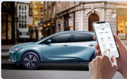
▲ Wireless phone key