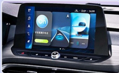
▲ On-board 4G hotspot