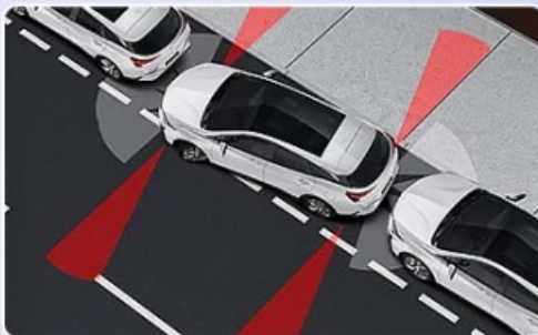
▲ APA automatic parking system