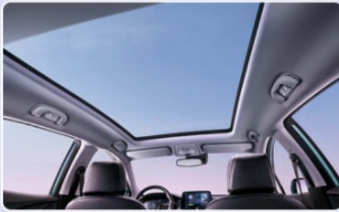
▲ Integrated panoramic skylight

Buick eConnect system allows you to connect Buick and phone freely