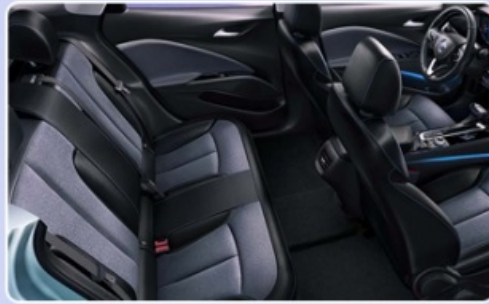
▲ Enormous space