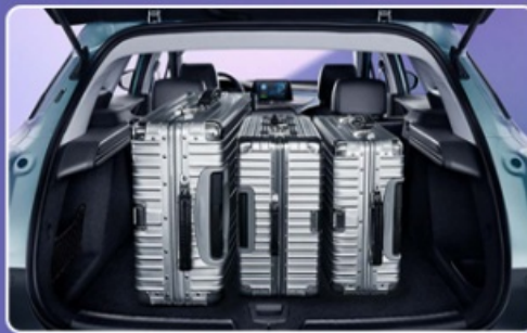
▲ 455L-1098L enormous trunk space