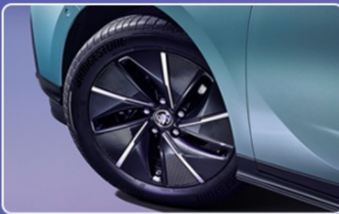
▲ 17 "aerodynamic wheel

It has the flexible styling of a sedan and offers larger driving and storage space like an MPV